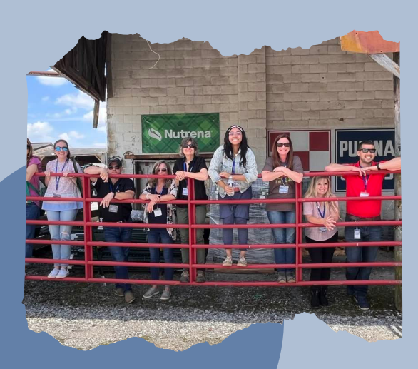
Upper Cleveland Day

email Kathryn@clevelandcountychamber.org